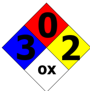
NFPA SCALE (0-4)